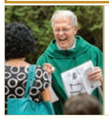
Support the well-being of our Boston priests. Text PRIEST to 56512 or visit us at clergyfunds.org.